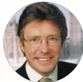
Phil Hope MP The Minister responsible for Building Regulations